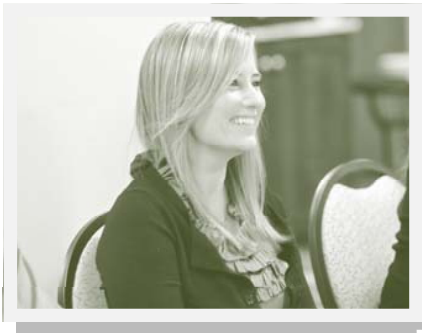
Prepare and Learn from the Best

Deer Oaks Mental Health Associates is a recognized training site in Texas. Deer Oaks is a member of APPIC (Association of Psychology Postdoctoral and Internship Centers) for postdoctoral training. The APPIC Program is a specialized training program for residents who have completed at least one year of supervised training, preferably at an APPIC or APA approved training site and have completed all other requirements for graduation as a Ph.D., Psy.D., or Ed.D. in the field of Psychology.